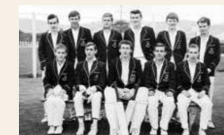
1962: First XI Cricket