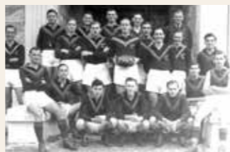
1945: A Grade Football