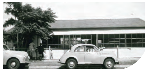
1952 St John's Opening

It is anticipated that the redeveloped Primary School will reach full triple-streamed enrolment in 2027. Coupled with the Middle and Senior School – this will be a record for Concordia College, making it one of the largest independent Colleges in South Australia.