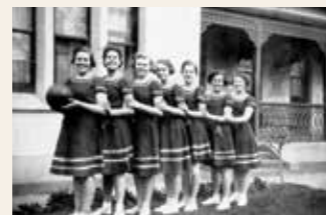
1937: Girls' Basketball