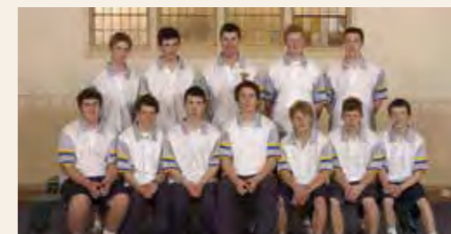
1992: Pedal Prix Team