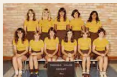
1982: Senior Softball