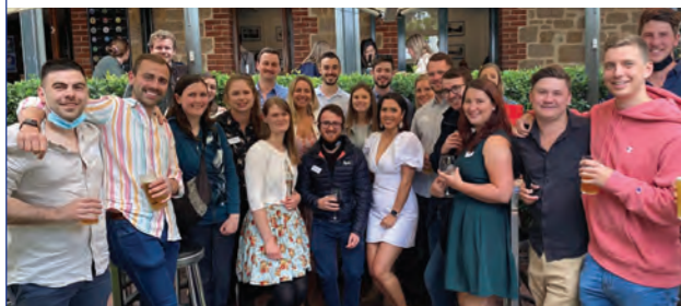
Class of 2011 - 10 Year Reunion Friday 26 November 2021