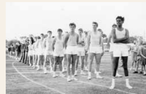
1965: Sports Day