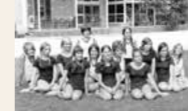
1973: Girls' Gymnastics