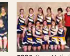
2003: Open Netball Team