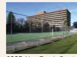
2003: New Tennis Courts