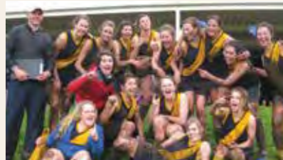
2010: Girls' Football