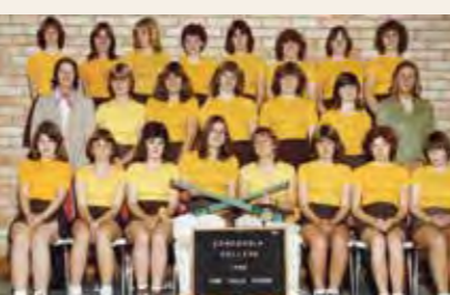
1980: Senior Gold House