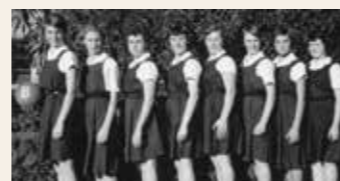
1950s: Girls' Basketball