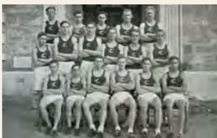
1949: Intercollegiate Athletics