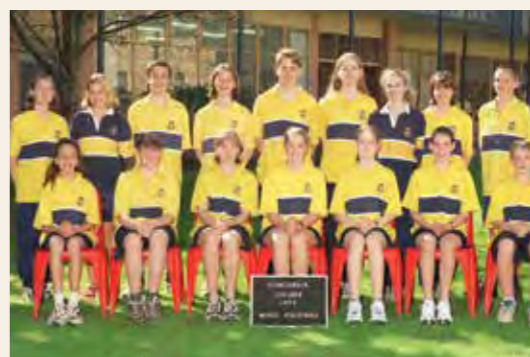
1999: Mixed Volleyball