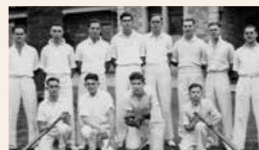
1942: Cricket Team