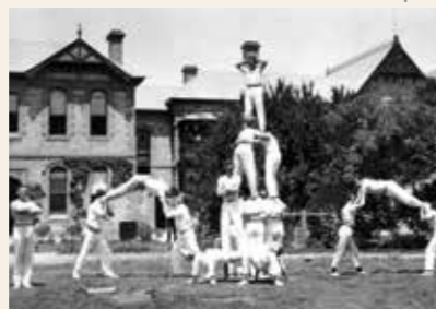
1926: Gymnastics Display at the Gym Opening