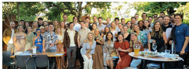
Class of 2016 - 5 Year Reunion Friday 3 December 2021