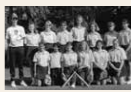
1993: Junior Softball