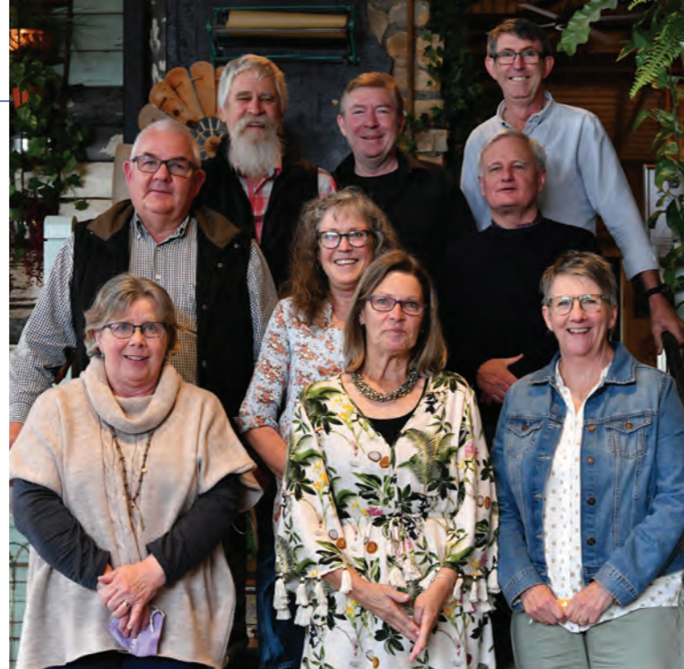
Class of 1971 - 50 Year Reunion Friday 12 November 2021