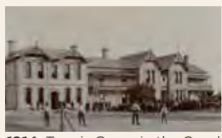
1914: Tennis Game in the Quadrangle