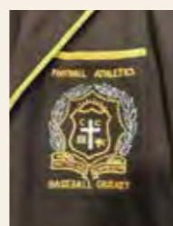
Four Blues on Neville Kriewaldt's Blazer Pocket