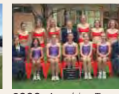
2000: Aerobics Team