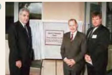
1999: Sports & Recreation Centre Opening