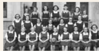
1940s: A, B and C Basketball