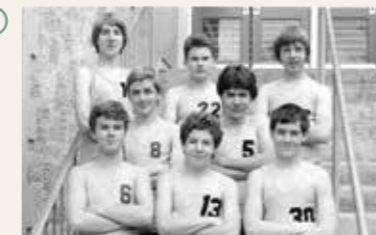
1985: U15 Basketball