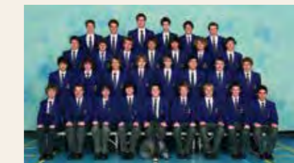
2009: Open Boys' Tennis

2003: The newly developed oval and eight tennis courts, at the now closed end of Cheltenham Street, were opened during the annual Twilight Tea.