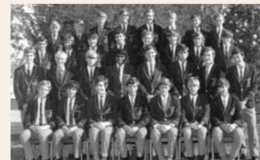
1970: Boys' Athletics