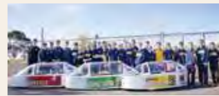
2013: Pedal Prix