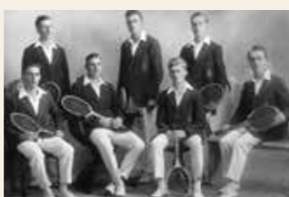
1923: Tennis Players