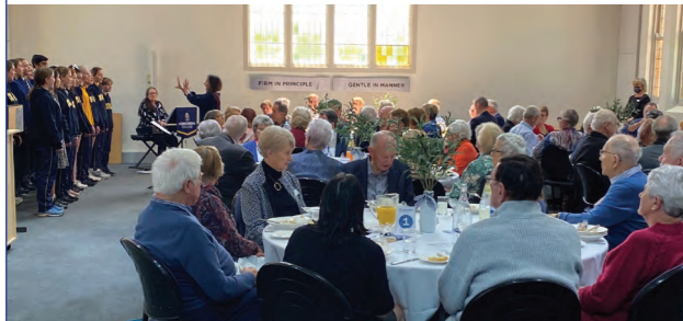
Brown & Gold 60+ Lunch Thursday 23 September 2021