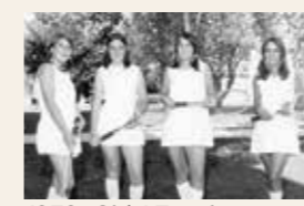
1970: Girls' Tennis