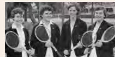
1958: Girls' Tennis